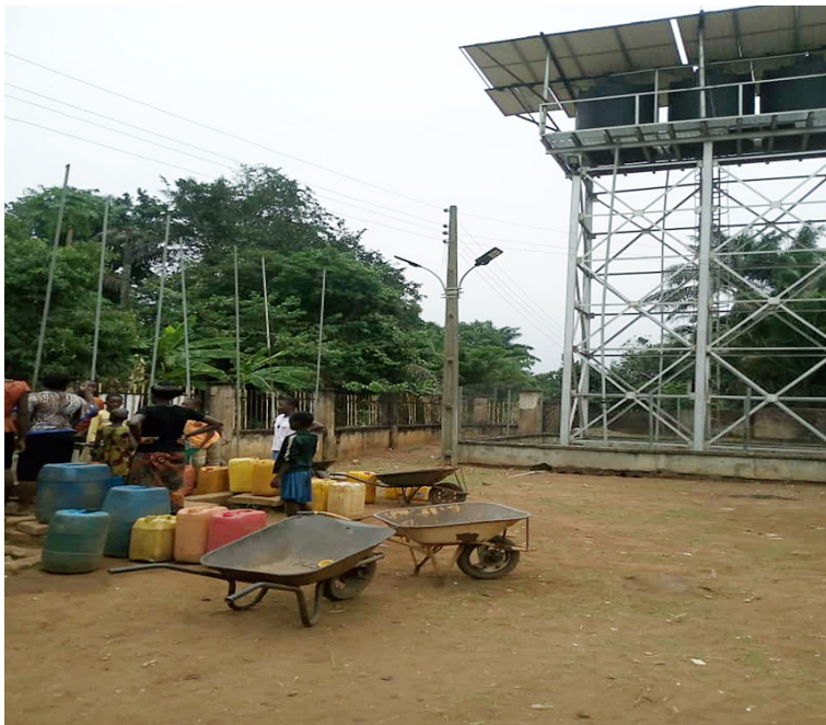
Fig. 1& 2: Water Boreholes in some of the Communities of Anambra State

This is why the Christian Aids Nigeria, 18 concluded that when a people are involved in the decision-making process, they cultivate a sense of proprietorship to the venture at hand. The sense of local rights that develop from the participatory process generate acceptability which when combined with integrity generate a strong social asset that allows every development project to be completed. As such, Mamah 9 concludes that when a project is planned and implemented with the locals, there is always a